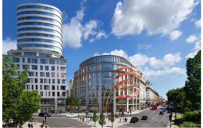
Marble Arch Place

This article uses our extensive knowledge to provide useful information about vertical transportation (VT) and construction market.